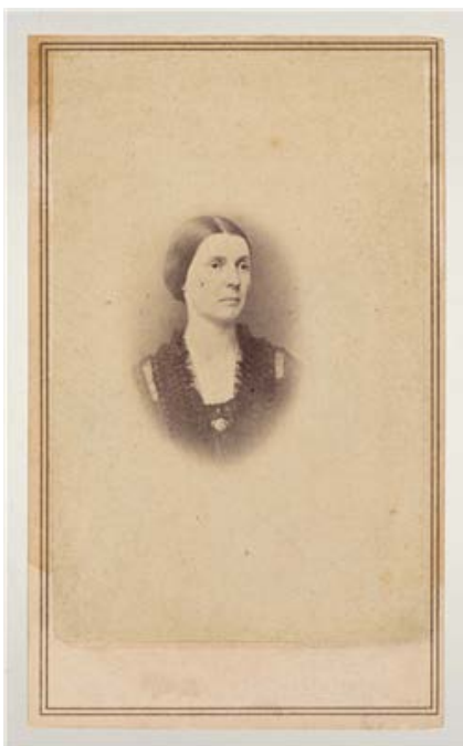
Rose O'Neal Greenhow

She also created a network of spies to share information, including white and black women and men. One of the most famous was a black woman named Mary Richards Bowser, who worked in the White House of the Confederacy for Jefferson Davis and his family in order to gather important information. Unfortunately, because many southerners knew she hadn't supported the Confederacy, Elizabeth was very unpopular in Richmond during and after The Civil War.