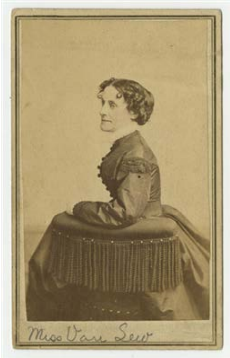
Elizabeth Van Lew

Elizabeth Van Lew lived in Richmond during The Civil War. Though she lived in the capitol of the Confederacy, she was an abolitionist who supported the Union. Elizabeth Van Lew used different techniques as a spy – she wrote in invisible ink, tore notes into shreds so they could be reassembled later, developed a secret code, and snuck messages out of Richmond in hollow eggs.